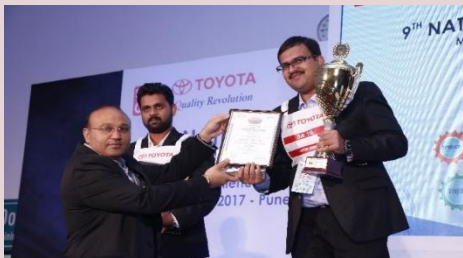
1 st Prize in Toyota 9 th National Seminar in SA T-TEP Category