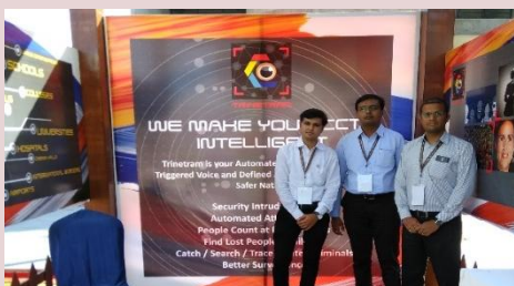
2 nd Prize in Gujarat Hackathon in 2018