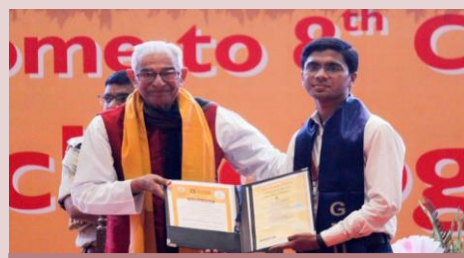
Gold Medal of Student in Gujarat Technological University