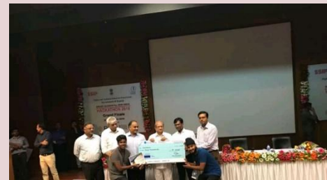
1 st Prize in Gujarat Hackathon in 2018