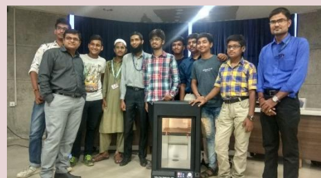
CIC3 Awards for Faculties and Students