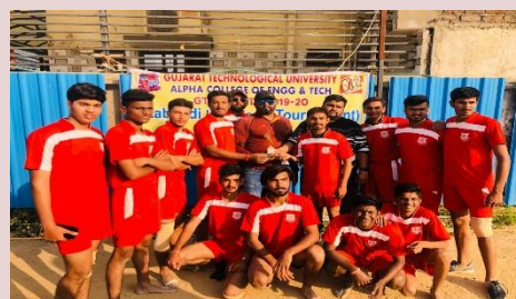
Winner in Inter-Zonal GTU Kabadi Tournament-2020