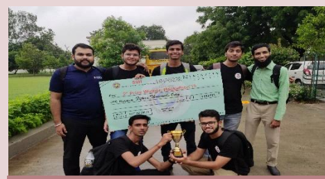
2 nd Prize in GTU Hackathon 2019