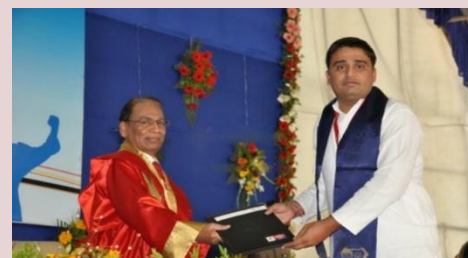
Gold Medal of Faculty in Gujarat Technological University