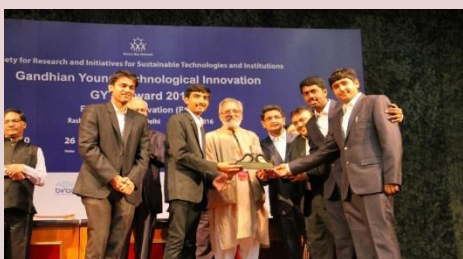
Gandhian Young Technological Innovation (GYTI) Award-2016