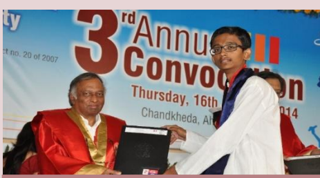
Gold Medal of Student in Gujarat Technological University