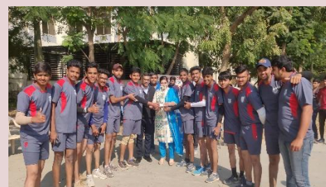
Winner in Inter-Zonal GTU Volleyball Tournament-2020