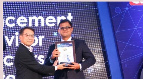
2 nd Prize in Toyota 10 th National Seminar in SA T-TEP Category