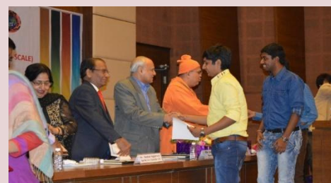
GTU Innovation Award-2015