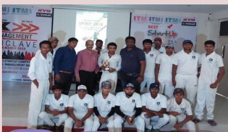
Winner GTU Inter-College Cricket Tournament 2018, Ahmedabad Zone