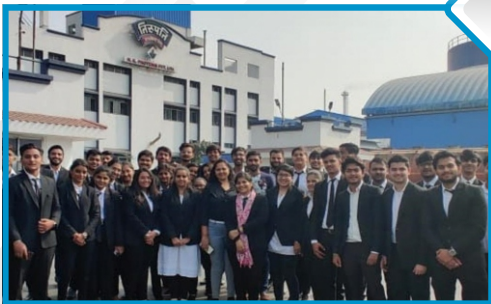
N K Protein Factory, Thol, Ahmedabad