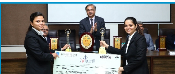
National Client Counselling Competition