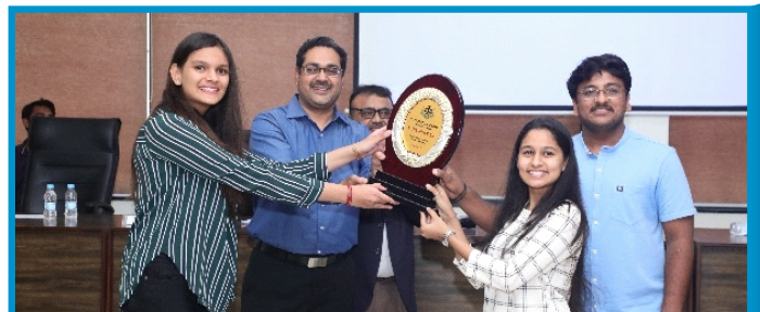
National Parliamentary Debate Competition