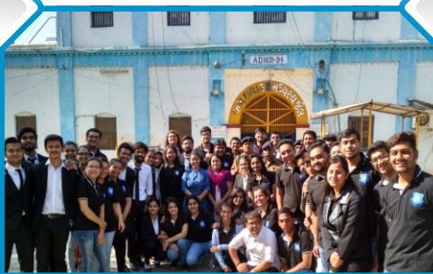
Central Jail, Sabarmati, Ahmedabad