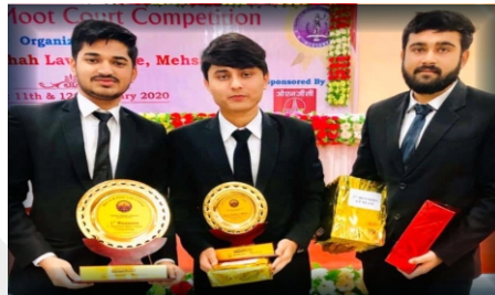
1 st runners up S.M. Shah Moot Court Competition at Mehsana, 2020