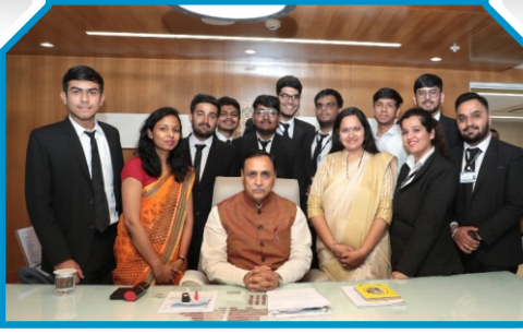
Gujarat Vidhansabha, Gandhinagar, meeting with Chief Minister, Gujarat Shri Vijay Rupani