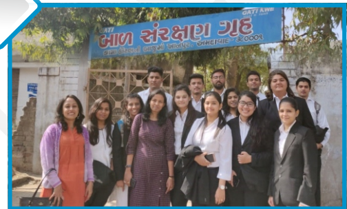
Juvenile Home, Khanpur, Ahmedabad