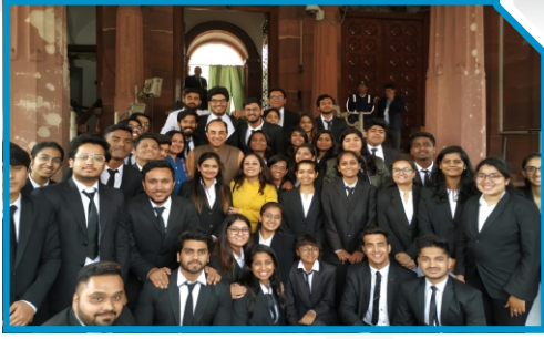
3 days Delhi visit, Visit to Lok Sabha and Rajyasabha Meeting with Mr. Subramaniam Swamy, Member of Parliament