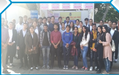
Visit to District Legal Service Authority Camp, Kankaria, Ahmedabad