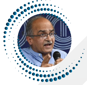
Sr. Adv. Prashant Bhushan Supreme Court of India