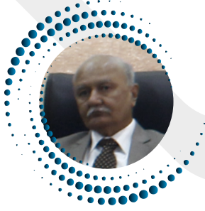
Hon'able Justice Mr. C.K. Butch Former Justice-Gujarat High court