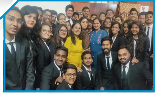
3 day Delhi Visit, Lok Sabha and Rajyasabha Meeting with Ms. Smriti Irani, Union Textile Minister