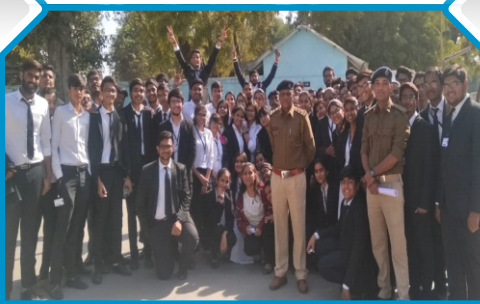
2 nd Visit to Central Jail, Sabarmati, Ahmedabad