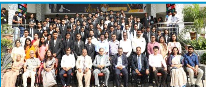
Vidhvata-II, September, 2019