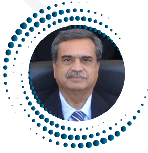
Hon'able Justice Mr. M.R. Shah, Justice of supreme court of India